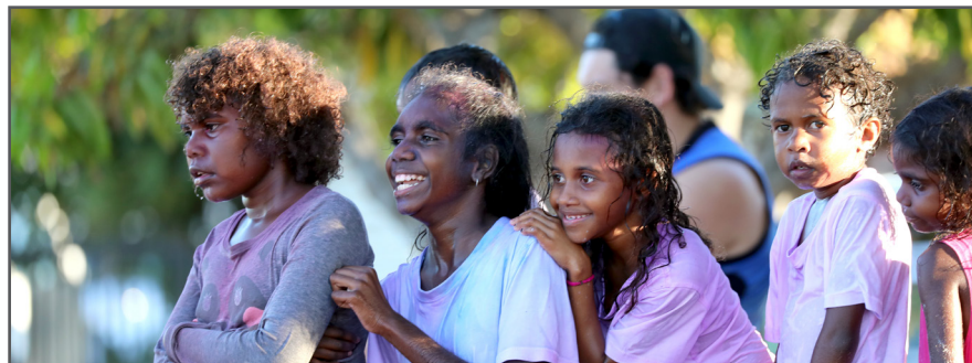
July 2019 Vacation Care

Pormpur Paanthu Outside School Hours Care (OSHC) and Vacation Care provides an opportunity for children to relax and play in a supervised environment.